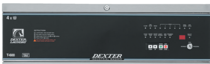
30 Cycle Control