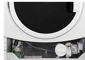
FRONT ACCESS PANEL