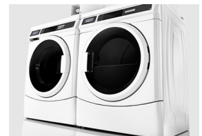
MATCHING WASHER AVAILABLE