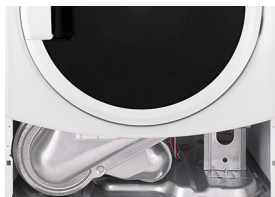
FRONT ACCESS PANEL