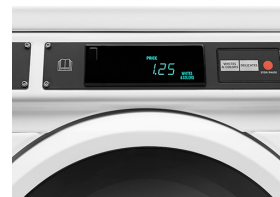
ONE-TOUCH CYCLE SELECTION